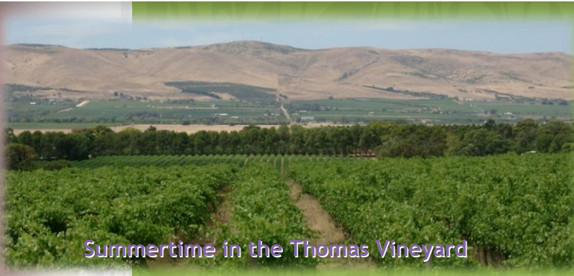
Summertime in the Thomas Vineyard