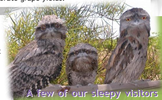
A few of our sleepy visitors to the vineyard over summer

We have had some good results from recent wine competitions. The 2004 Reserve Shiraz won a Silver Medal Best In Class at the International Wine and Spirit Competition in London judged in November. Considered one of the world's most prestigious wine competitions the show judged 450 Shiraz entries with the total number of wines tasted over 6,000 from 80 countries. To add to the medal tally both the 2005 and 2006 Reserve Shiraz won a Top 100 Blue-Gold Medal in the Sydney International Wine Show.